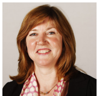
Alison Johnstone Scottish Green Party