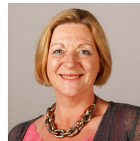
Linda Fabiani Scottish National Party