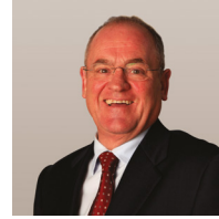
Deputy Convener Duncan McNeil Scottish Labour