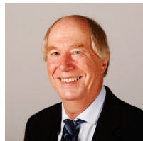
Malcolm Chisholm Scottish Labour