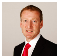
Tavish Scott Scottish Liberal Democrats