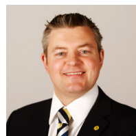
Stuart McMillan Scottish National Party