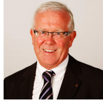
Convener Bruce Crawford Scottish National Party